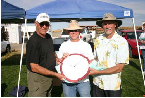
Competitor Team Champs