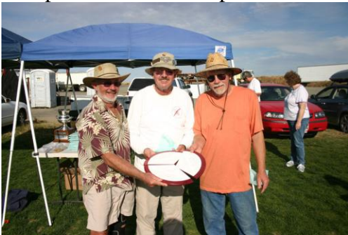
Expert Team Champs