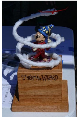
Paradise Thermal Wizard